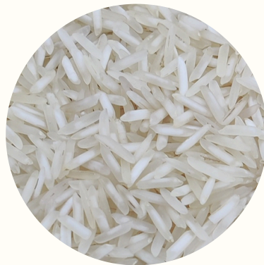
1509 Steam 8.40+ mm