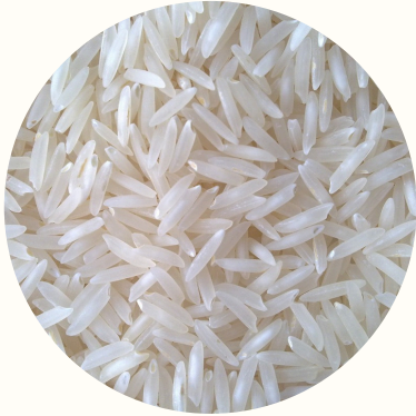
1121 Raw 8.35 mm