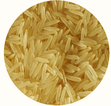
1121 Golden Sella 8.35 mm