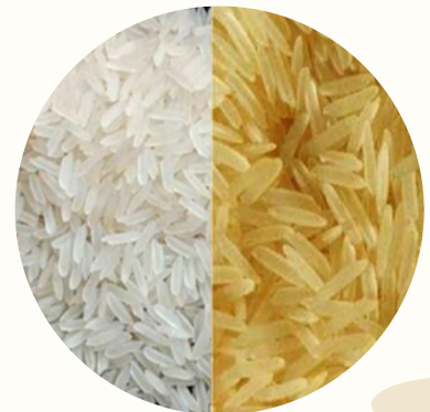
PR11 Sella/Golden Sella