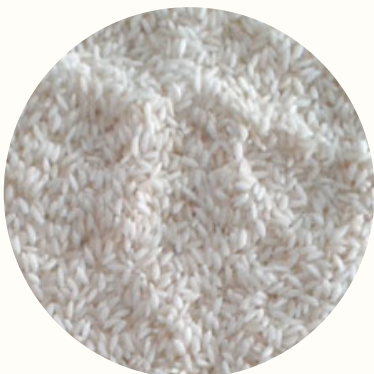
Sona Masoori Steam IR64 Raw/Parboiled