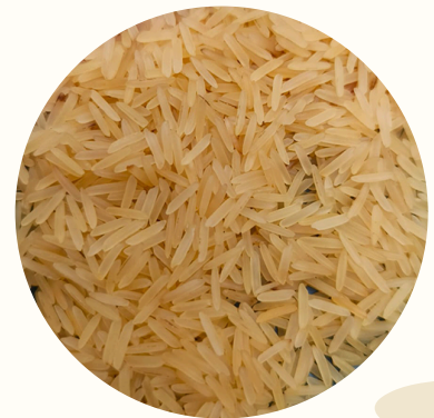
1509 Golden Sella 8.40 mm