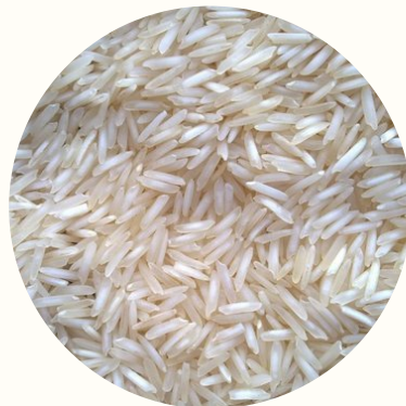
PR 11 Steam