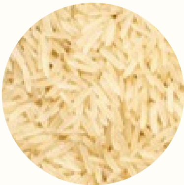
1121 Sella 8.30+ mm