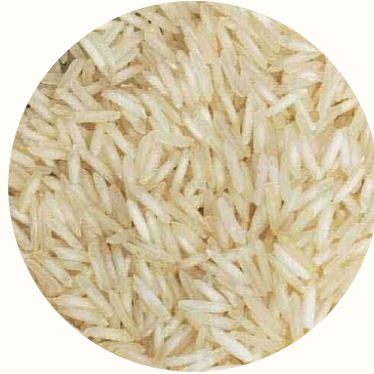
1121 Steam 8.35 mm