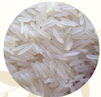
Pusa Sella 7.70 mm