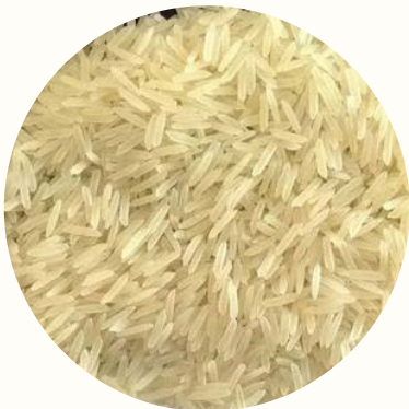
1509 Sella 8.40 mm