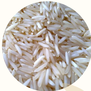
Pusa Steam 7.70 mm