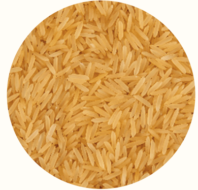
Sugandha Golden Sella