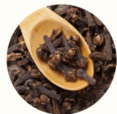
Cassia ( Cinnamomum )